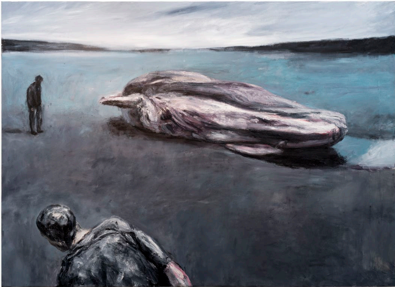
Johann Louw Goeiendag Monsieur Courbet, op Jakobsbaai 2019 Oil on Canvas 193 x 284 cm