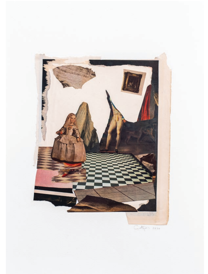
Kate Gottgens A tale without handmaids 2020 Collage on Paper 77 x 57 cm

R 38 000.00 (Selling Price Exclusive of VAT)