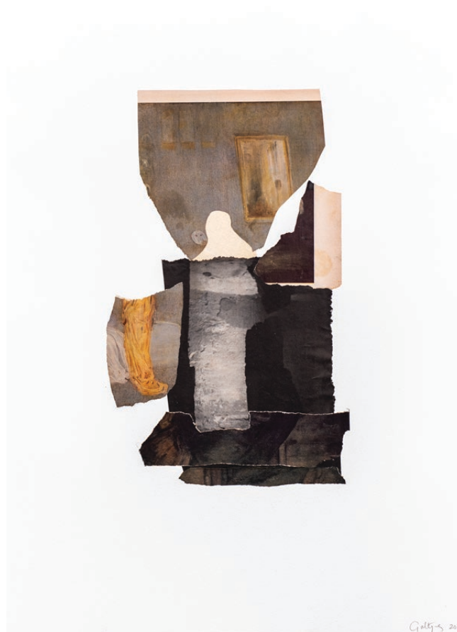
Kate Gottgens Ghost 2020 Collage on Paper 76 x 57 cm

R 45 000.00 (Selling Price Exclusive of VAT)