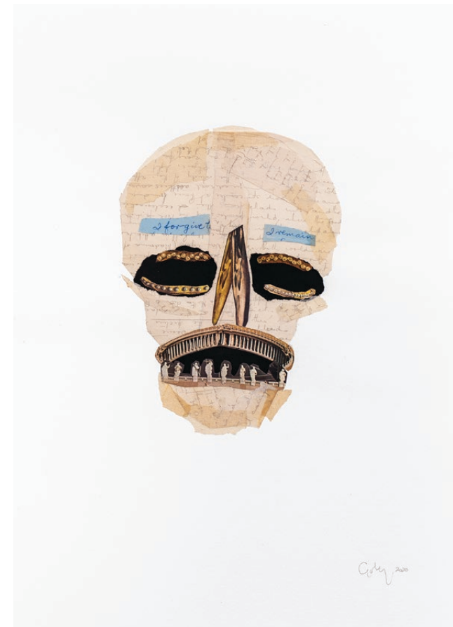
Kate Gottgens Vanitas III (Skull with a pious smile) 2020 Collage on Paper 76 x 56 cm

R 38 000.00 (Selling Price Exclusive of VAT)