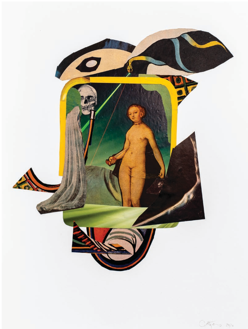
Kate Gottgens Room 237 2020 Collage on Paper 76 x 57 cm

R 38 000.00 (Selling Price Exclusive of VAT)