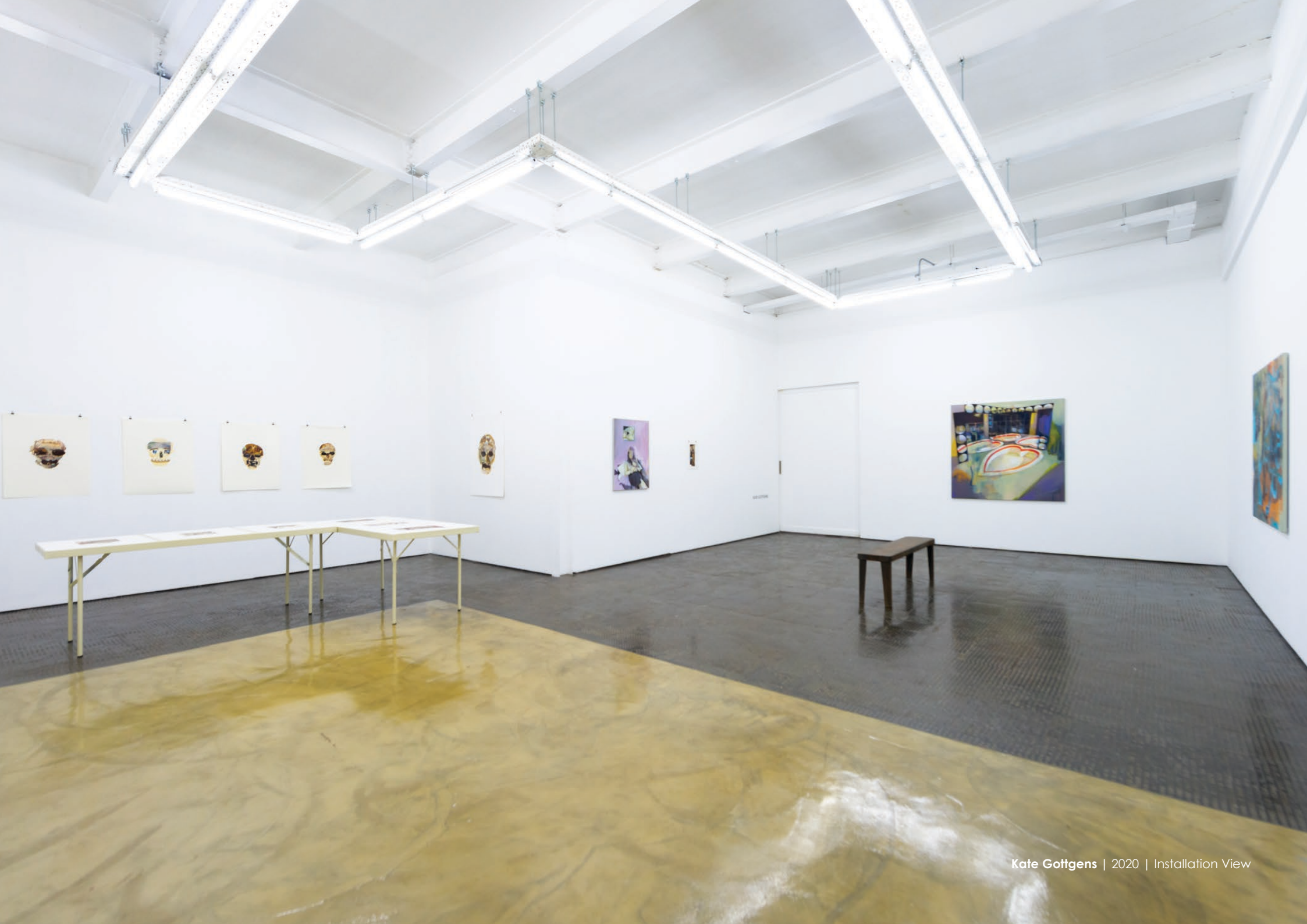
Kate Gottgens | 2020 | Installation View