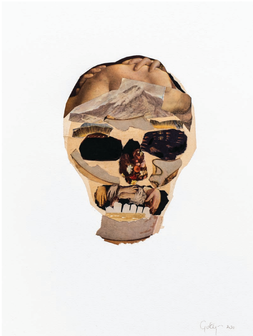
Kate Gottgens Vanitas II (Skull with Renaissance teeth) 2020 Collage on Paper 77 x 56 cm

R 35 000.00 (Selling Price Exclusive of VAT)