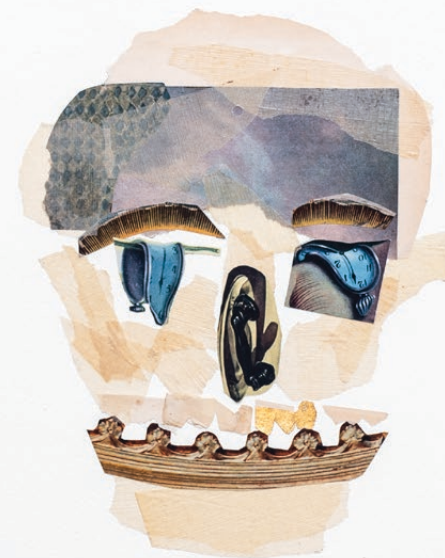
Kate Gottgens Vanitas I (Skull with three gold teeth) 2020 Collage on Paper 77 x 56 cm

R 38 000.00 (Selling Price Exclusive of VAT)