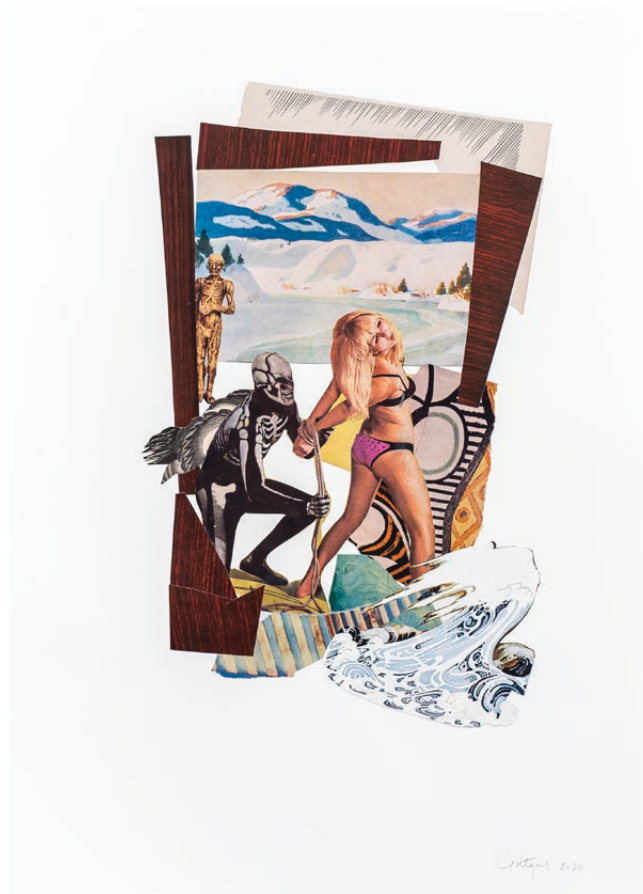
Kate Gottgens Nordic noir 2020 Collage on Paper 77 x 57 cm

R 38 000.00 (Selling Price Exclusive of VAT)