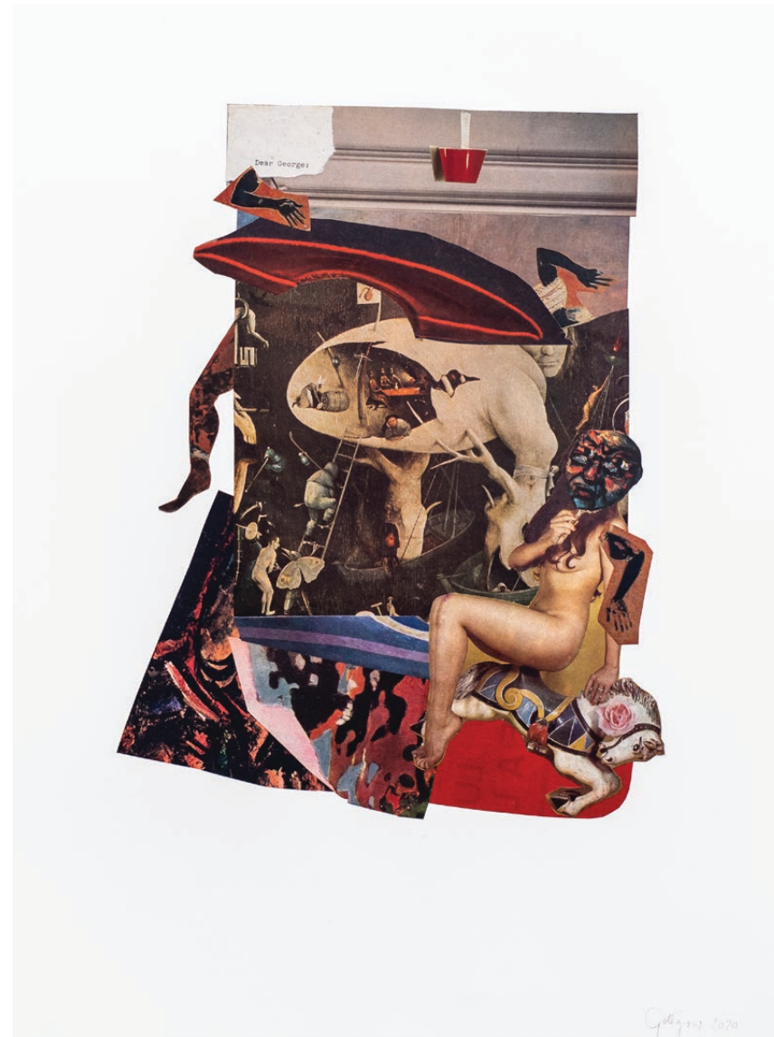
Kate Gottgens Room 101 2020 Collage on Paper 76 x 57 cm

R 38 000.00 (Selling Price Exclusive of VAT)