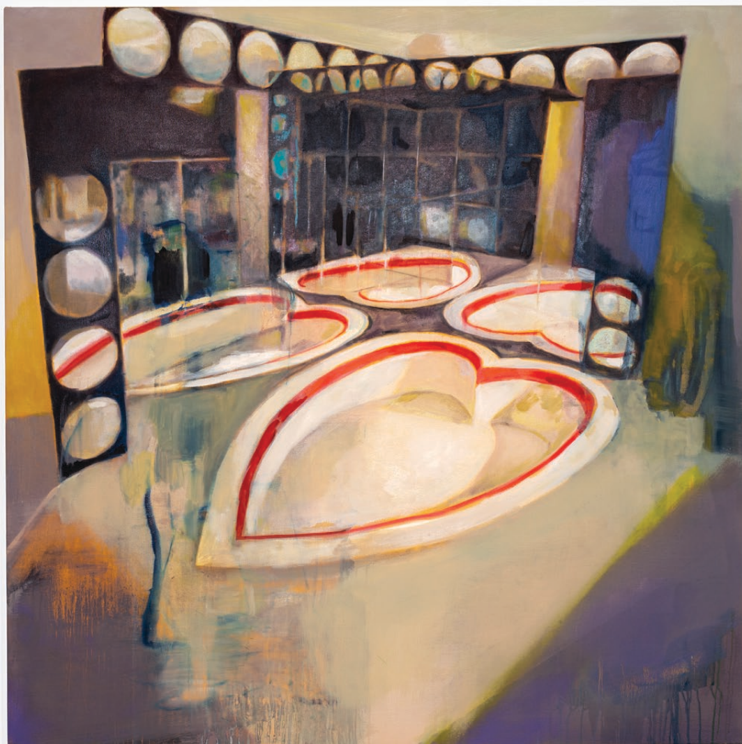
Kate Gottgens Love Abandoned 2020 Oil on Canvas 140 x 140 cm

R 165 000.00 (Selling Price Exclusive of VAT)