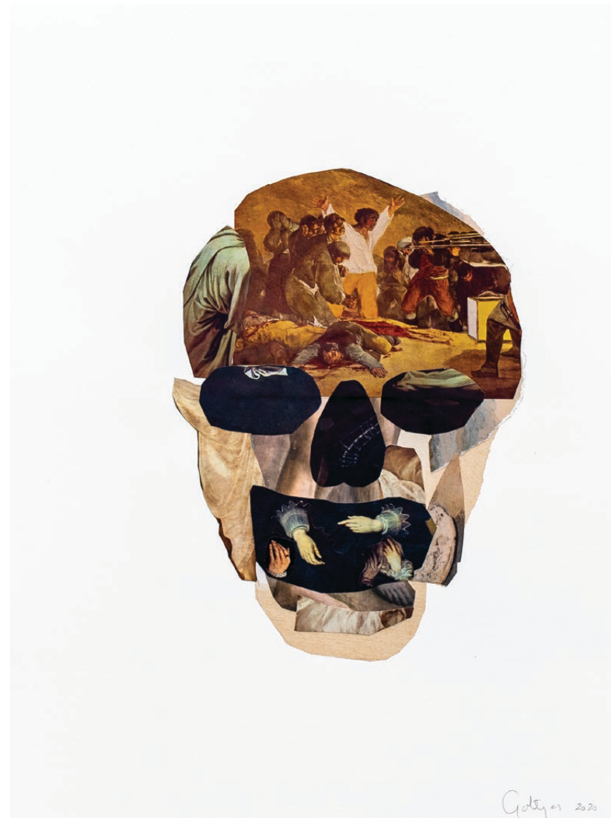
Kate Gottgens Vanitas IV (I can't breathe) 2020 Collage on Paper 76 x 56 cm

R 35 000.00 (Selling Price Exclusive of VAT)