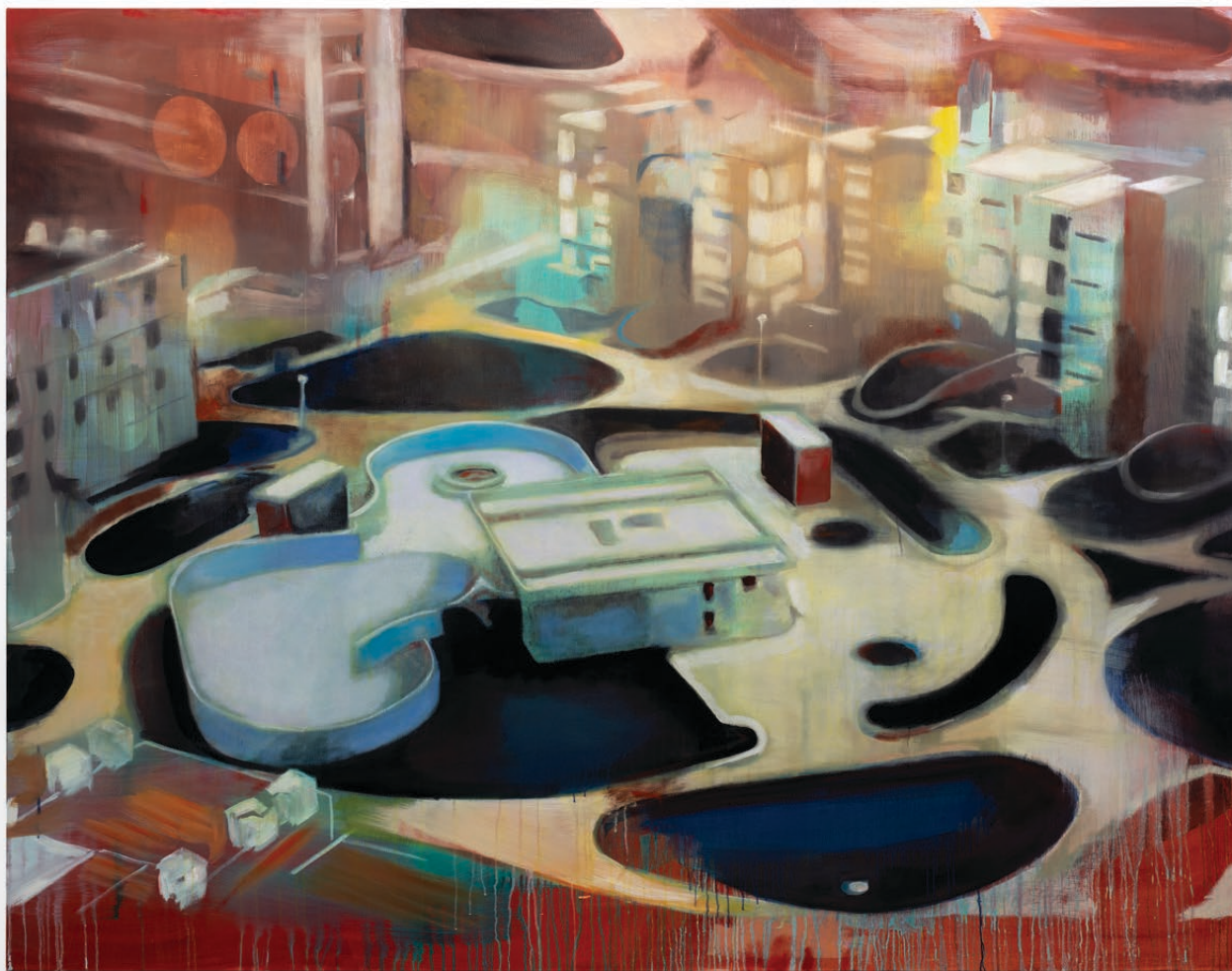
Kate Gottgens Tilt 2020 Oil on Canvas 168 x 214 cm

R 265 000.00 (Selling Price Exclusive of VAT)