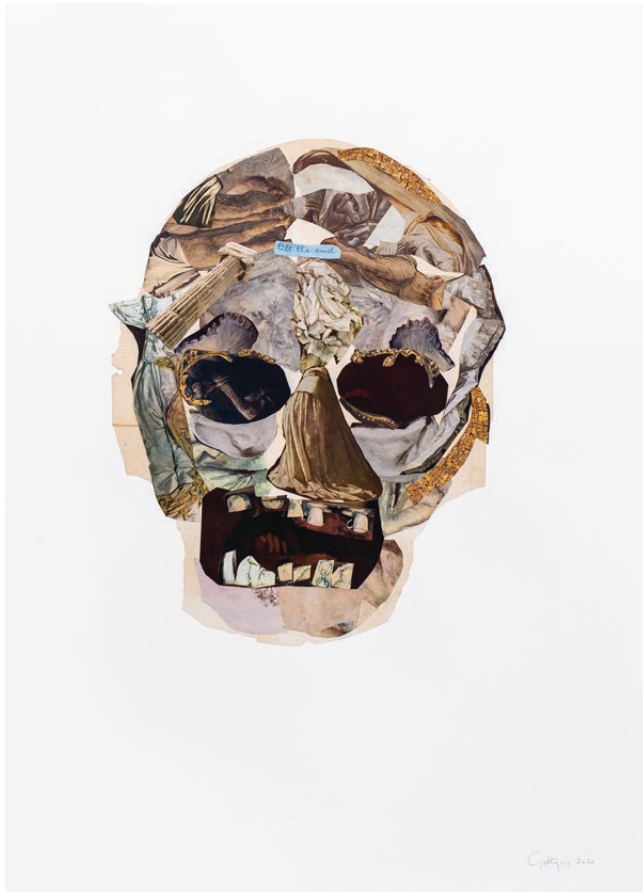
Kate Gottgens Vanitas VI (Till the end) 2020 Collage on Paper 105.5 x 75 cm

R 45 000.00 (Selling Price Exclusive of VAT)