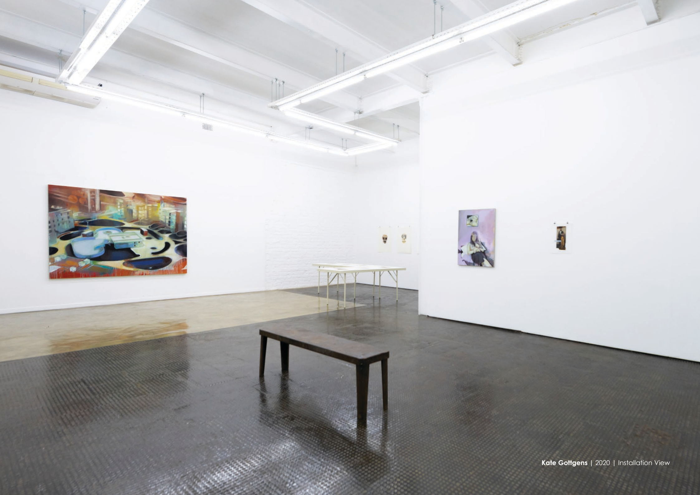
Kate Gottgens | 2020 | Installation View