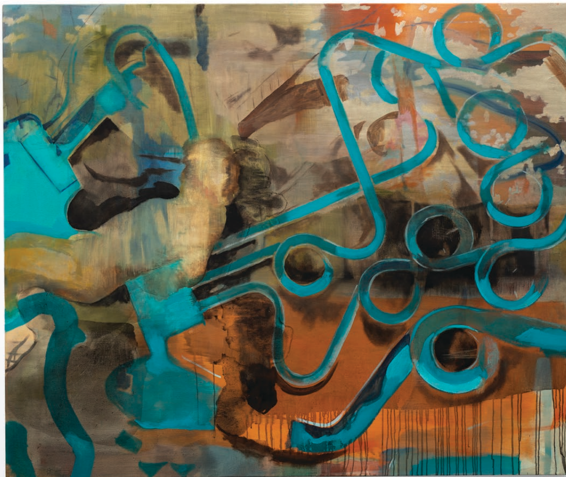
Kate Gottgens Nothing is completely satisfying 2020 Oil on Canvas 125 x 150 cm

R 155 000.00 (Selling Price Exclusive of VAT)