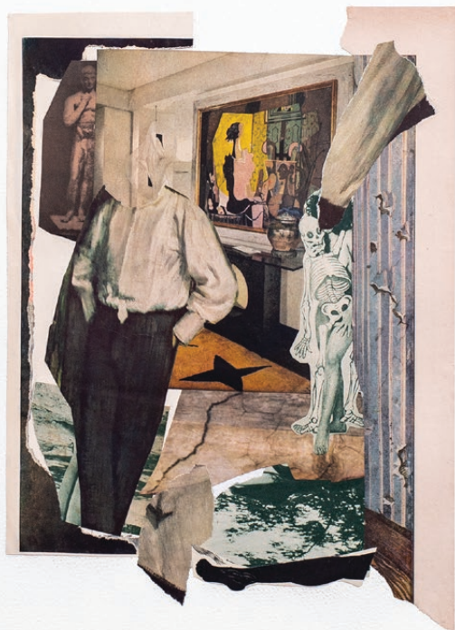
Kate Gottgens Behind the drapes 2020 Collage on Paper 77 x 57 cm

R 38 000.00 (Selling Price Exclusive of VAT)