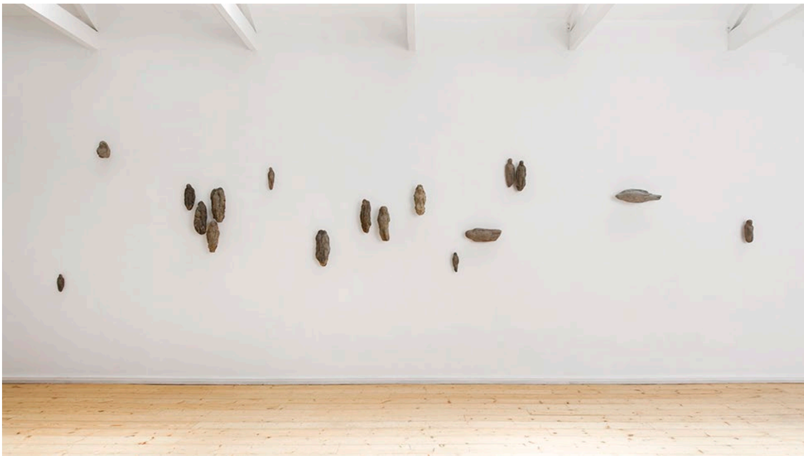
Ledelle Moe Findings XII 2018 Concrete and Steel Dimensions Variable