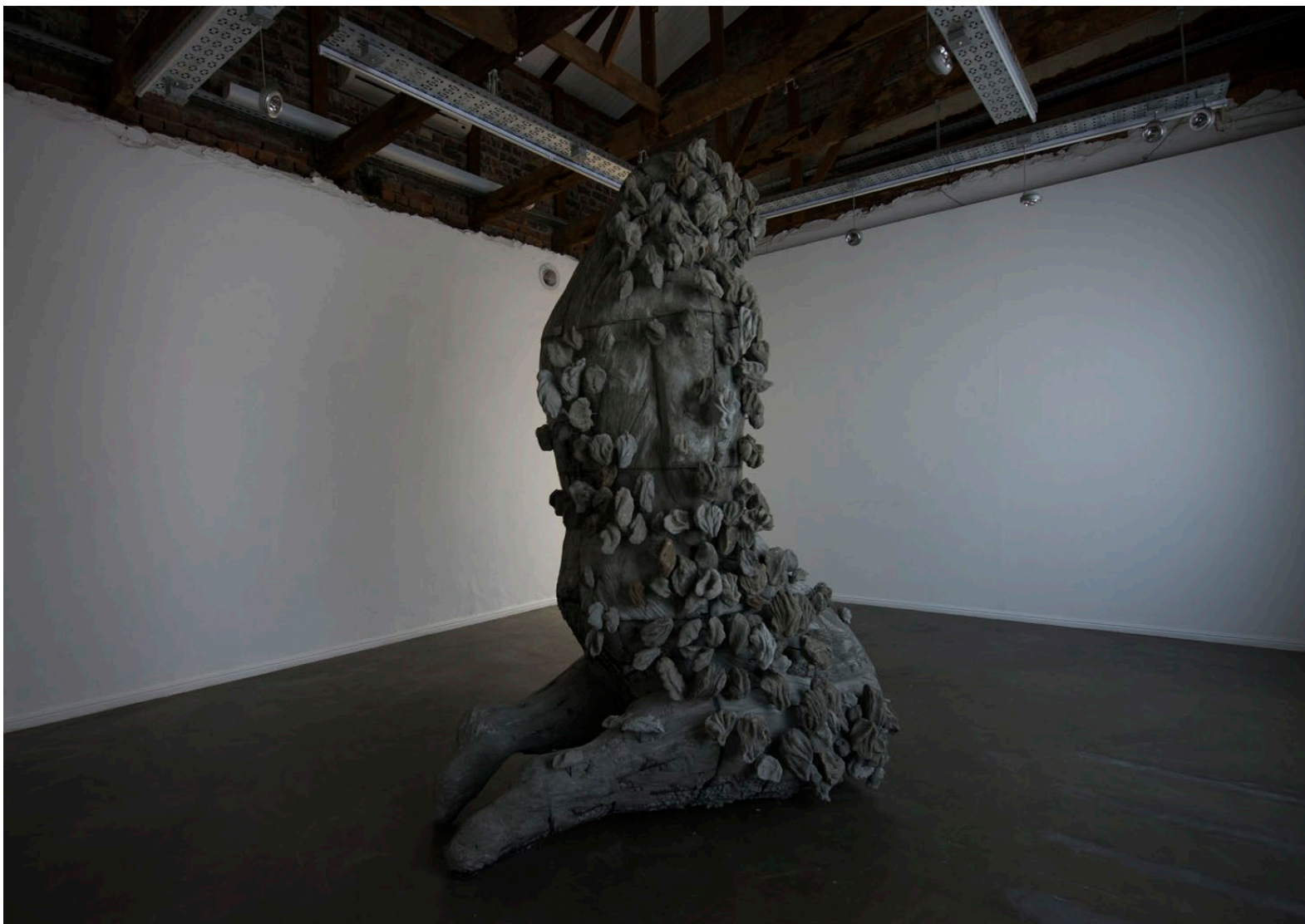
Ledelle Moe Study for Remain 2018 Concrete and Steel 270 x 190 x 120 cm