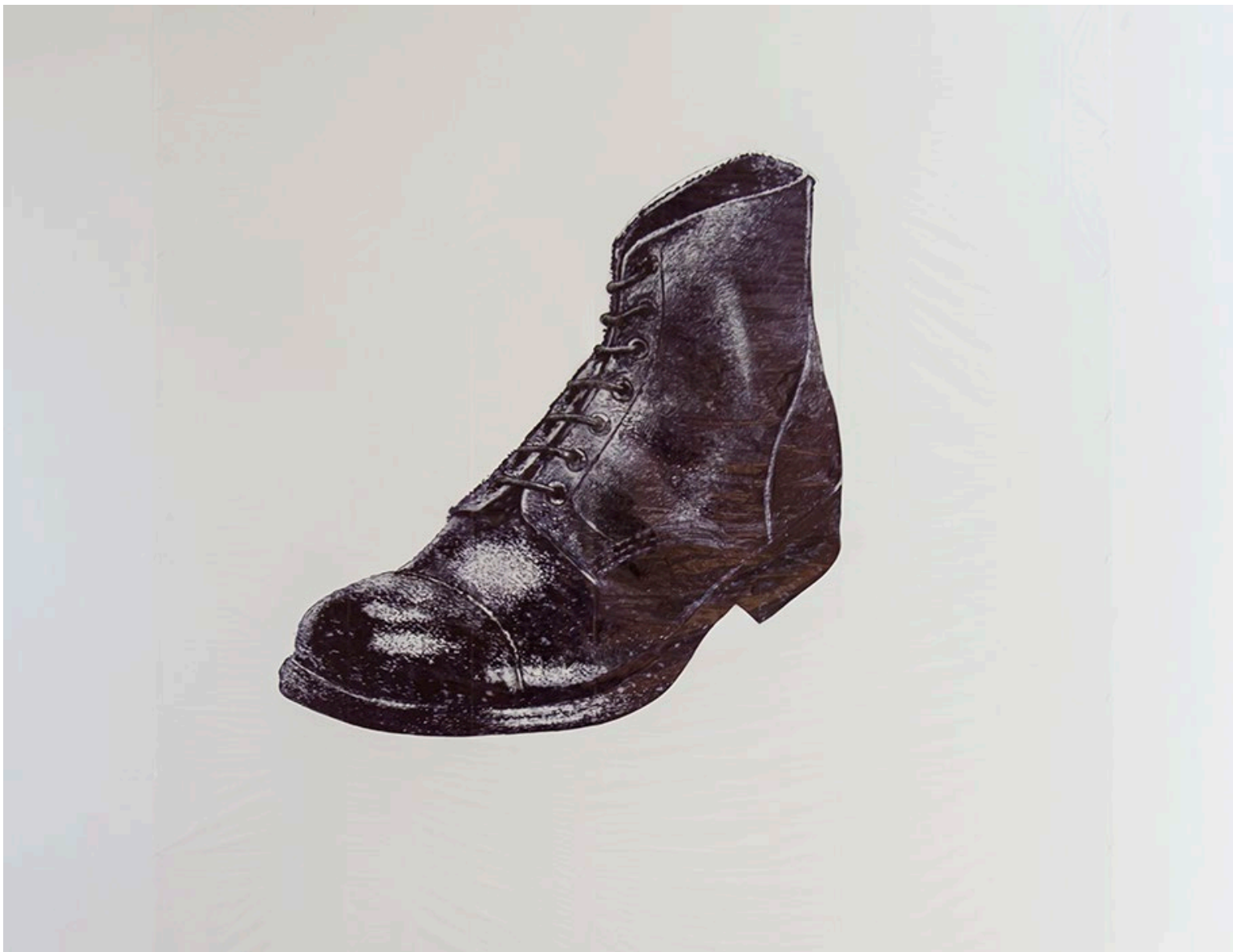
Siemon Allen Boot 2018 Permanent felt marker on polypropylene sheeting 300 x 261 cm