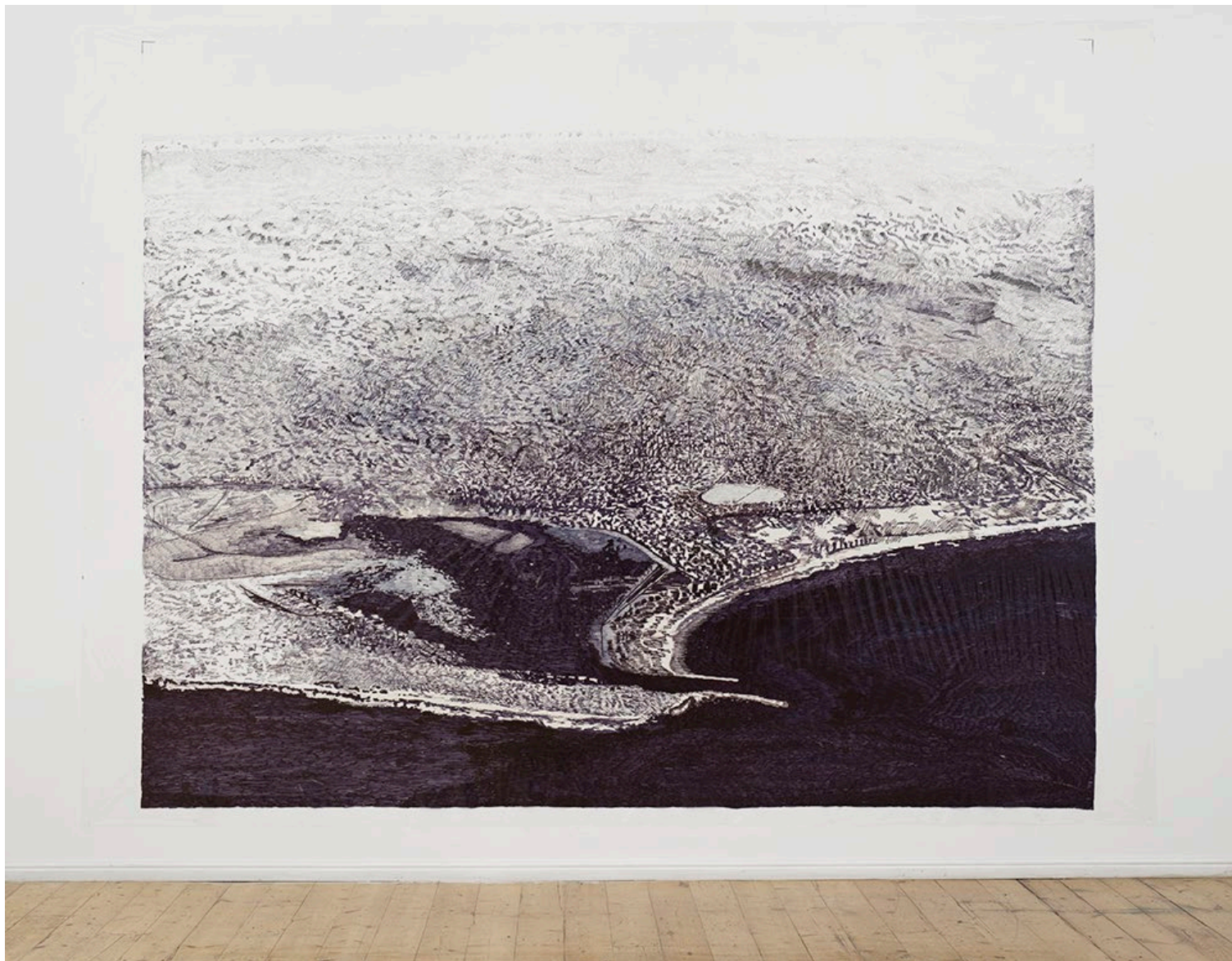
Siemon Allen Durban, KwaZulu-Natal 2018 Permanent felt marker on polypropylene sheeting 265 x 366 cm