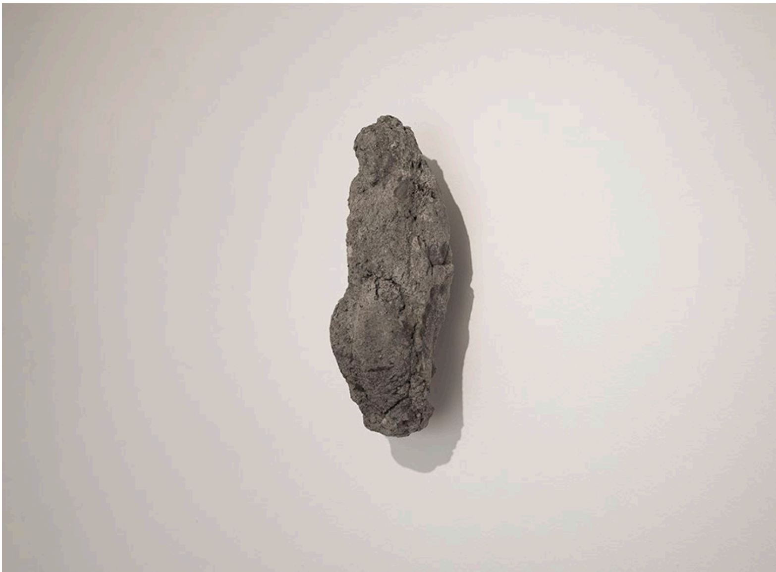
Ledelle Moe Finding XI 2018 Concrete and Steel 34 x 11.5 x 14.5 cm