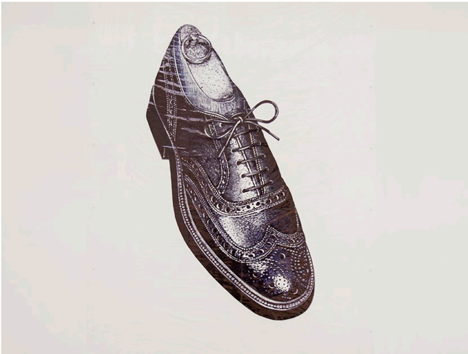
Siemon Allen Jarman 2018 Permanent felt marker on polypropylene sheeting 270 x 180 cm