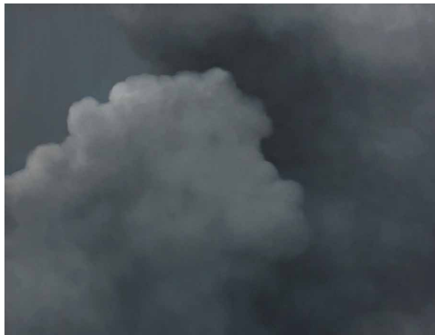
N 11.53974, W 85.61821 2013 Oil on Canvas 61 x 76 cm