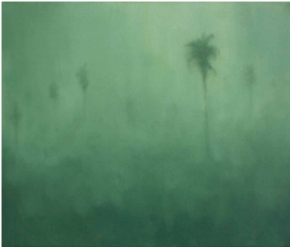
N13.273029, W88.615433 2013 Oil on Canvas 51 x 61 cm