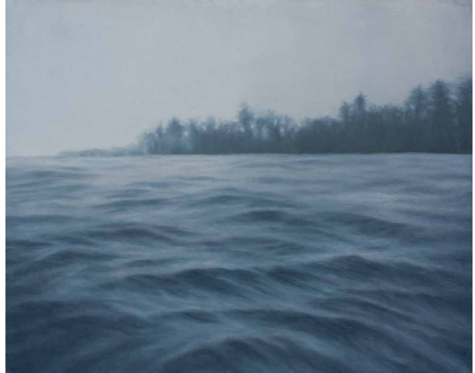
N 10.87045, W 85.90093 2012 Oil on Canvas 65 x 81 cm