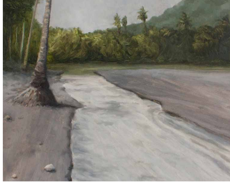
N10.857036, W85.773446 2013 Oil on Paper 31 x 40 cm