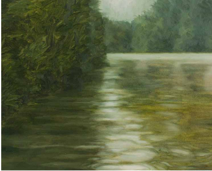
N10.856698, W85.775892 2013 Oil on Paper 31 x 40 cm