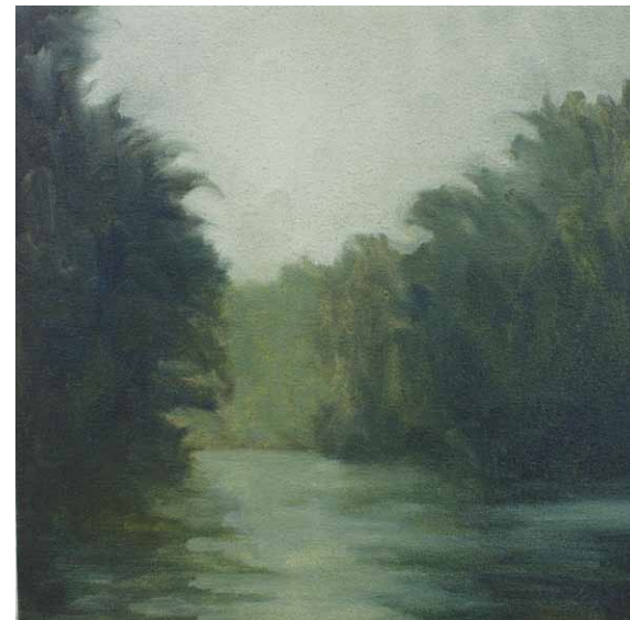
N 10.799183, W 85.551356 2013 Oil on Canvas 31 x 31 cm