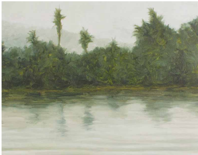
N10.857036, W85.76954 2013 Oil on Paper 31 x 40 cm