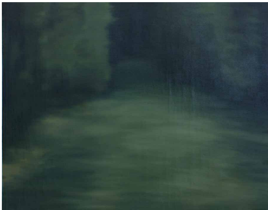
N10.80108, W85.548974 2013 Oil on Canvas 65 x 80 cm