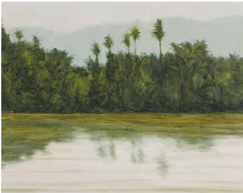
N10.856614, W85.770889 2013 Oil on Paper 31 x 40 cm