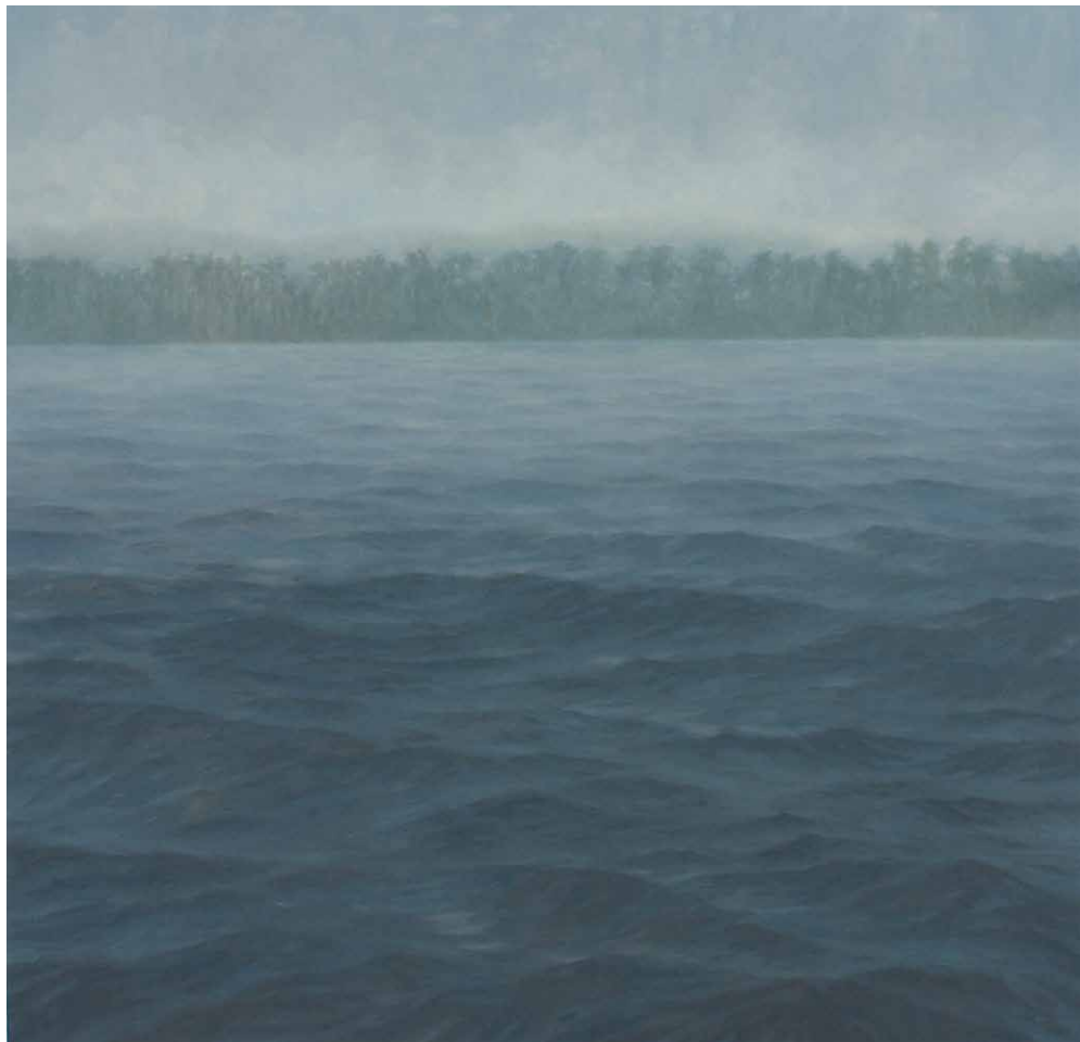
N10.858427, W85.930279 | 2013 | Oil on Canvas | 160 x 160 cm