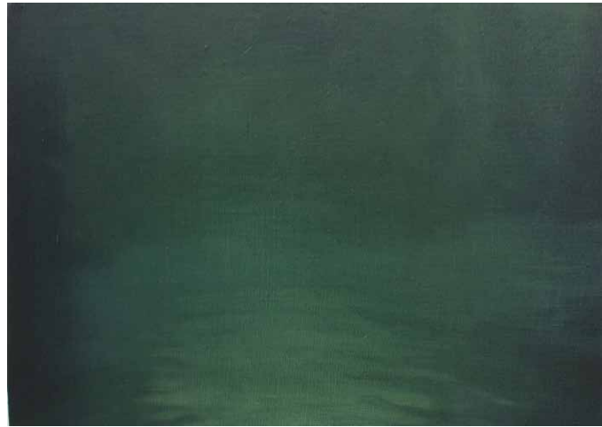
N 10.807656, W 85.548051 | 2013 | Oil on Canvas | 25 x 35 cm