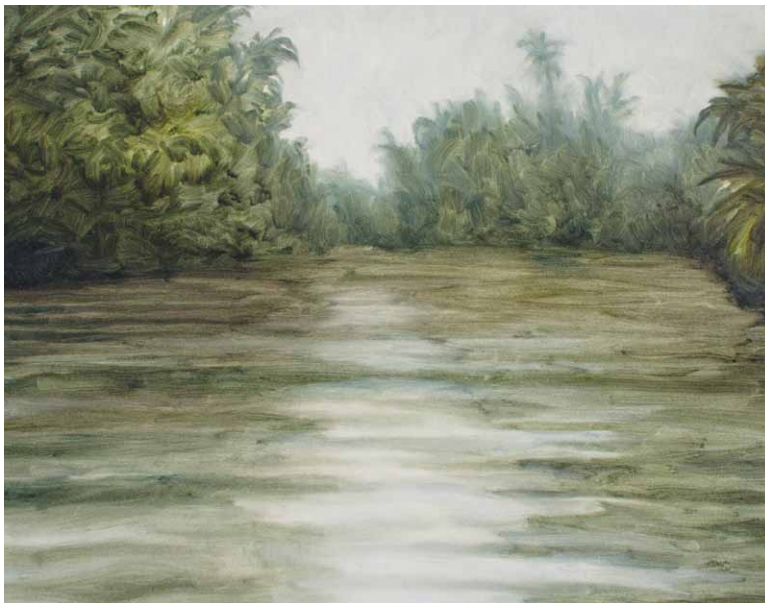
N10.856909, W85.770653 2013 Oil on Paper 31 x 40 cm