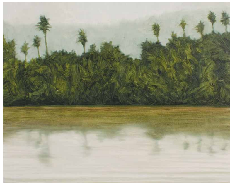
N10.856614, W85.767309 2013 Oil on Paper 31 x 40 cm