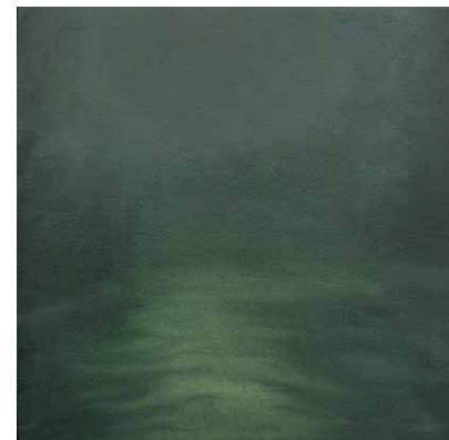
N10.746548, W85.546892 2013 Oil on Canvas 25 x 25 cm