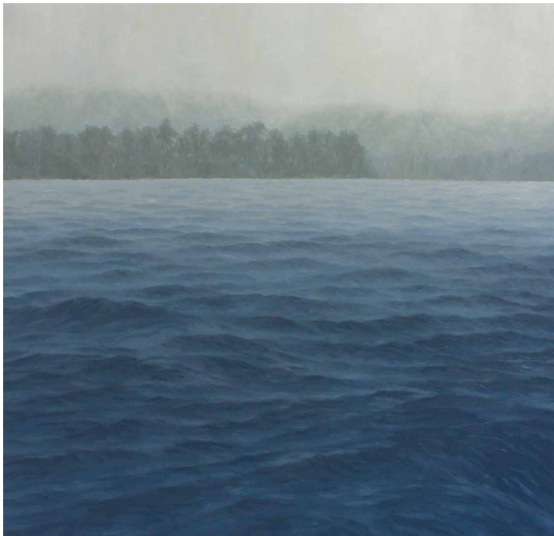
N10.854886, W85.917748 2013 Oil on Canvas 160 x 160 cm