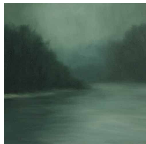
N 10.708135, W 85.53136 | 2013 | Oil on Canvas | 25 x 35 cm