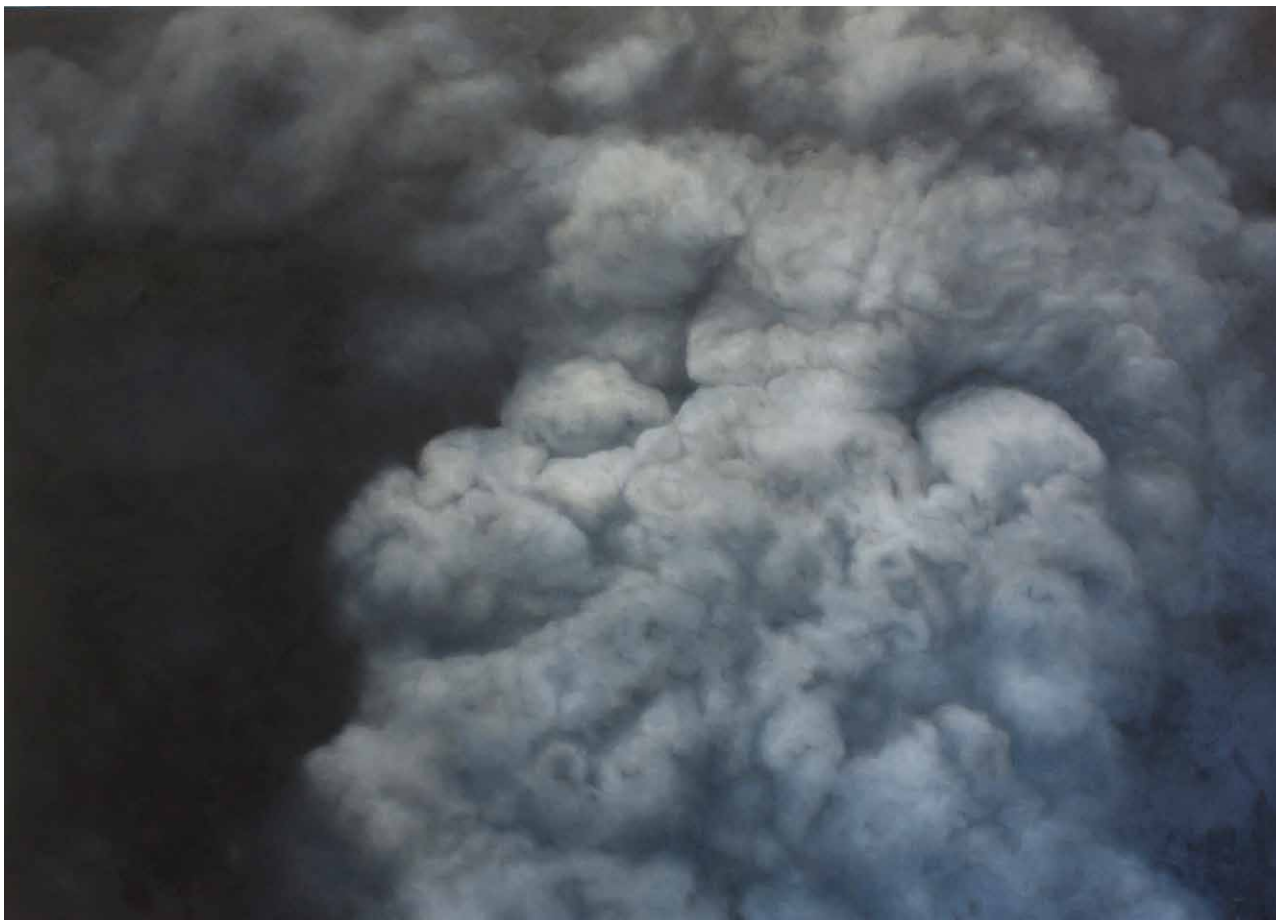
N11.442003, W85.507305 2013 Oil on Canvas 150 x 210 cm