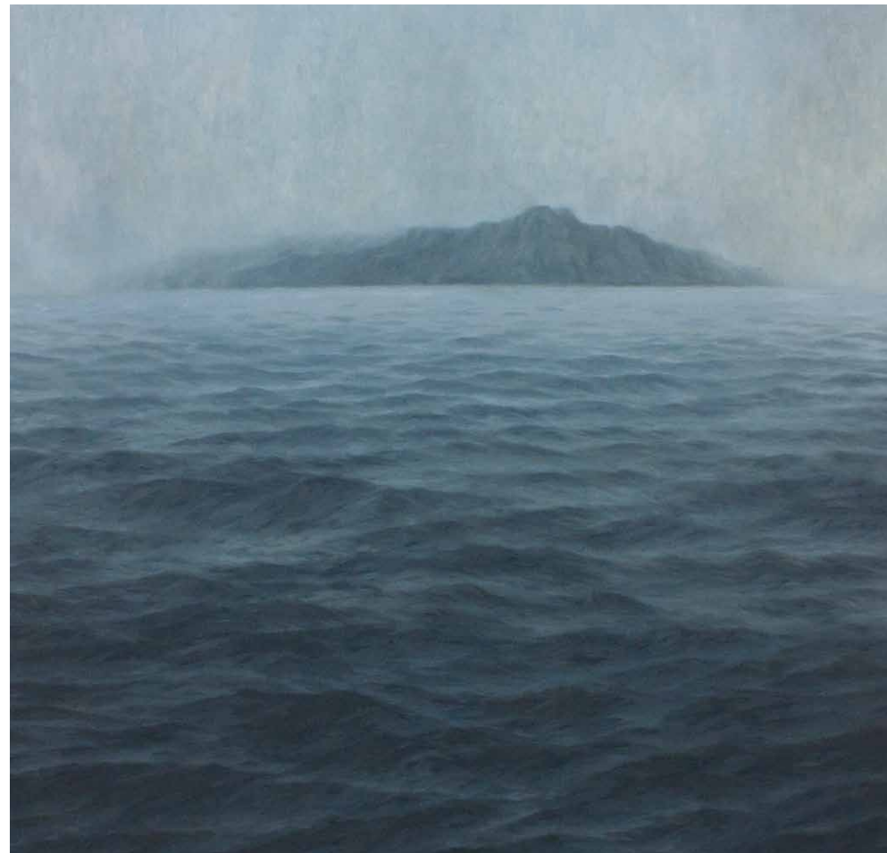
N10.838881, W85.8854 | 2013 | Oil on Canvas | 160 x 160 cm