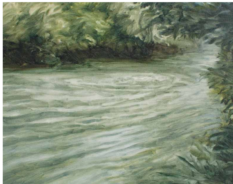
N10.857141, W85.77031 2013 Oil on Paper 31 x 40 cm