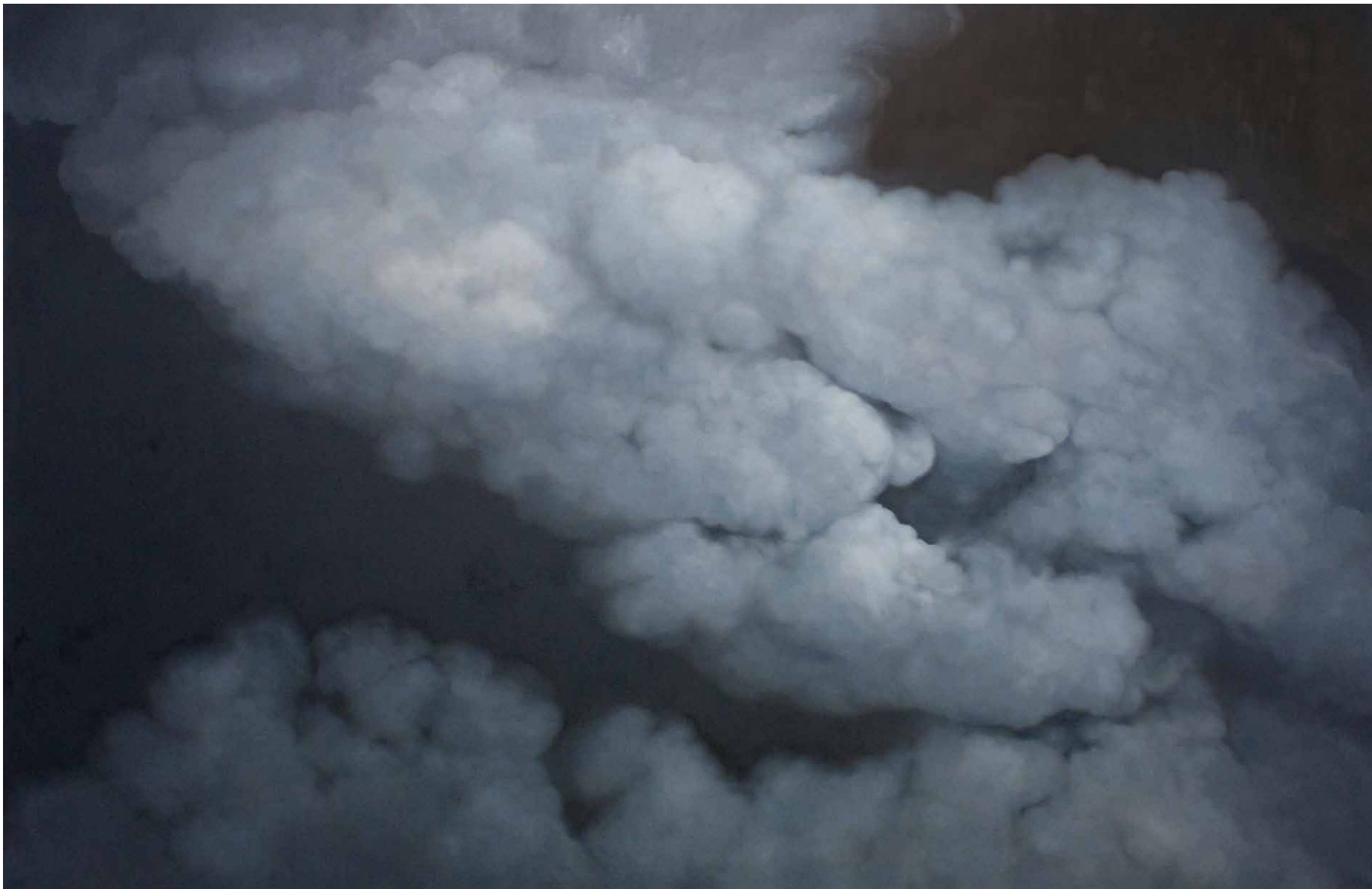
N11.539739, W85.616997 | 2013 | Oil on Canvas | 228 x 350 cm