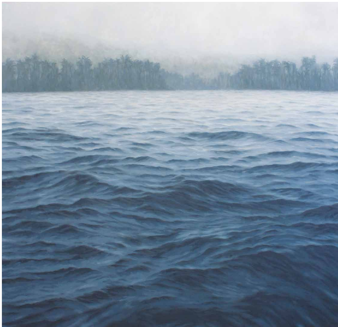
N 10.841399, W 85.875374 2013 Oil on Canvas 165 x 165 cm