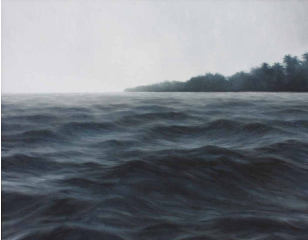
La Punta (El Salvador) 2012 Oil on Canvas 70 x 90.5 cm