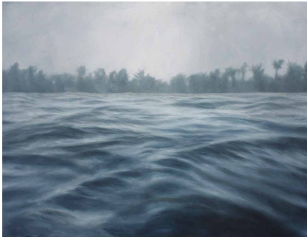
N10.839881, W85.874317 2013 Oil on Canvas 97 x 127 cm