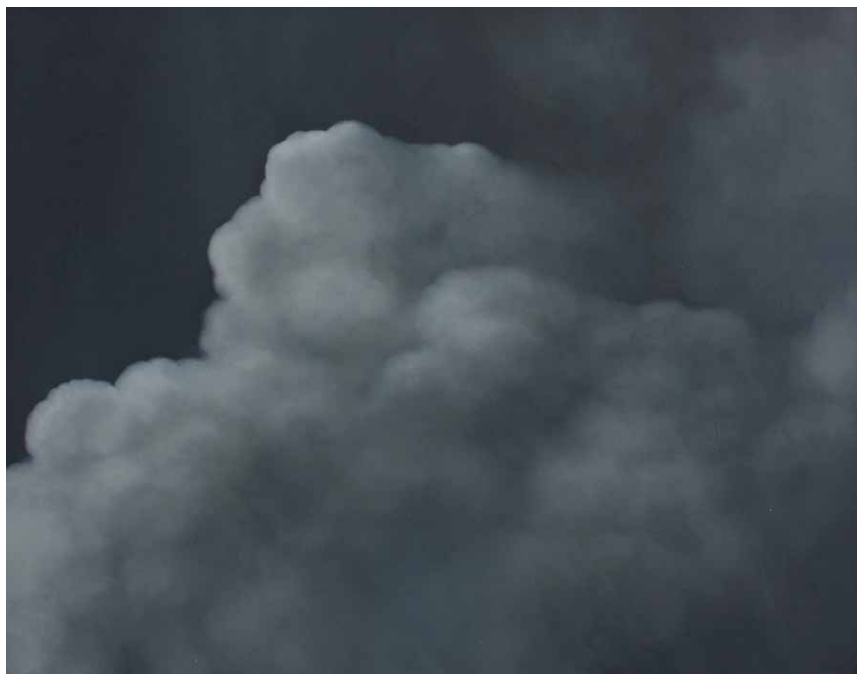
N 11.53974, W 85.61719 2013 Oil on Canvas 61 x 76 cm