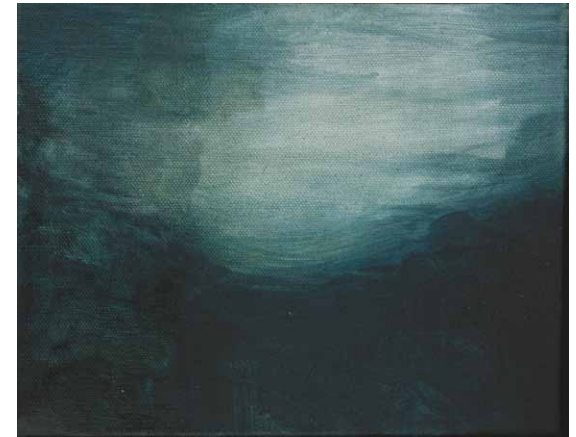
N 10.762843, W 85.544832 | 2013 | Oil on Canvas | 20.5 x 25 cm