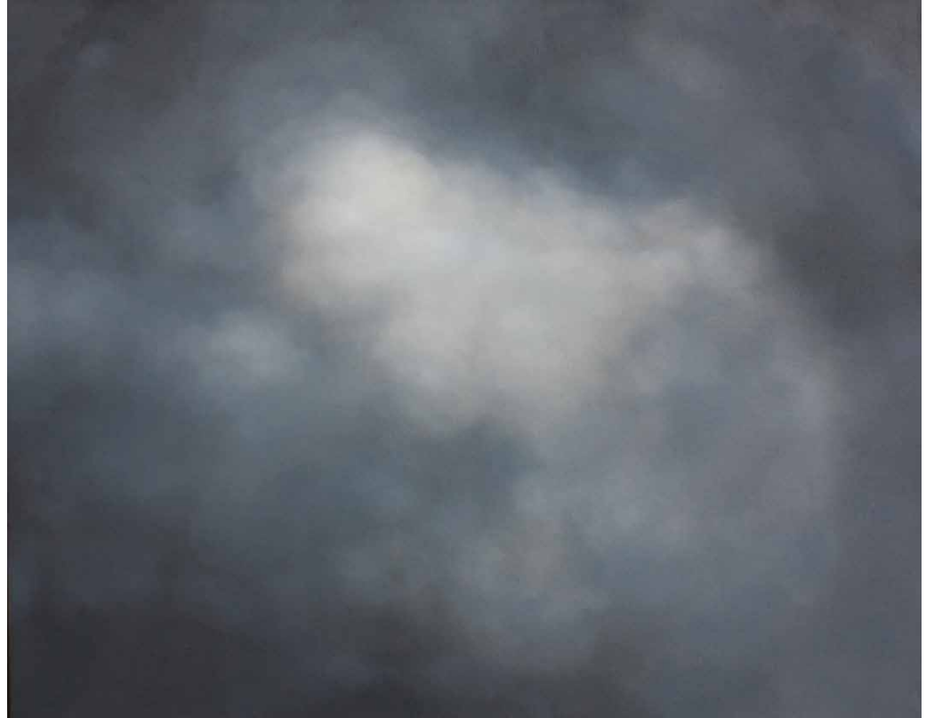
N 11.53974, W 85.61698 2013 Oil on Canvas 61 x 76 cm