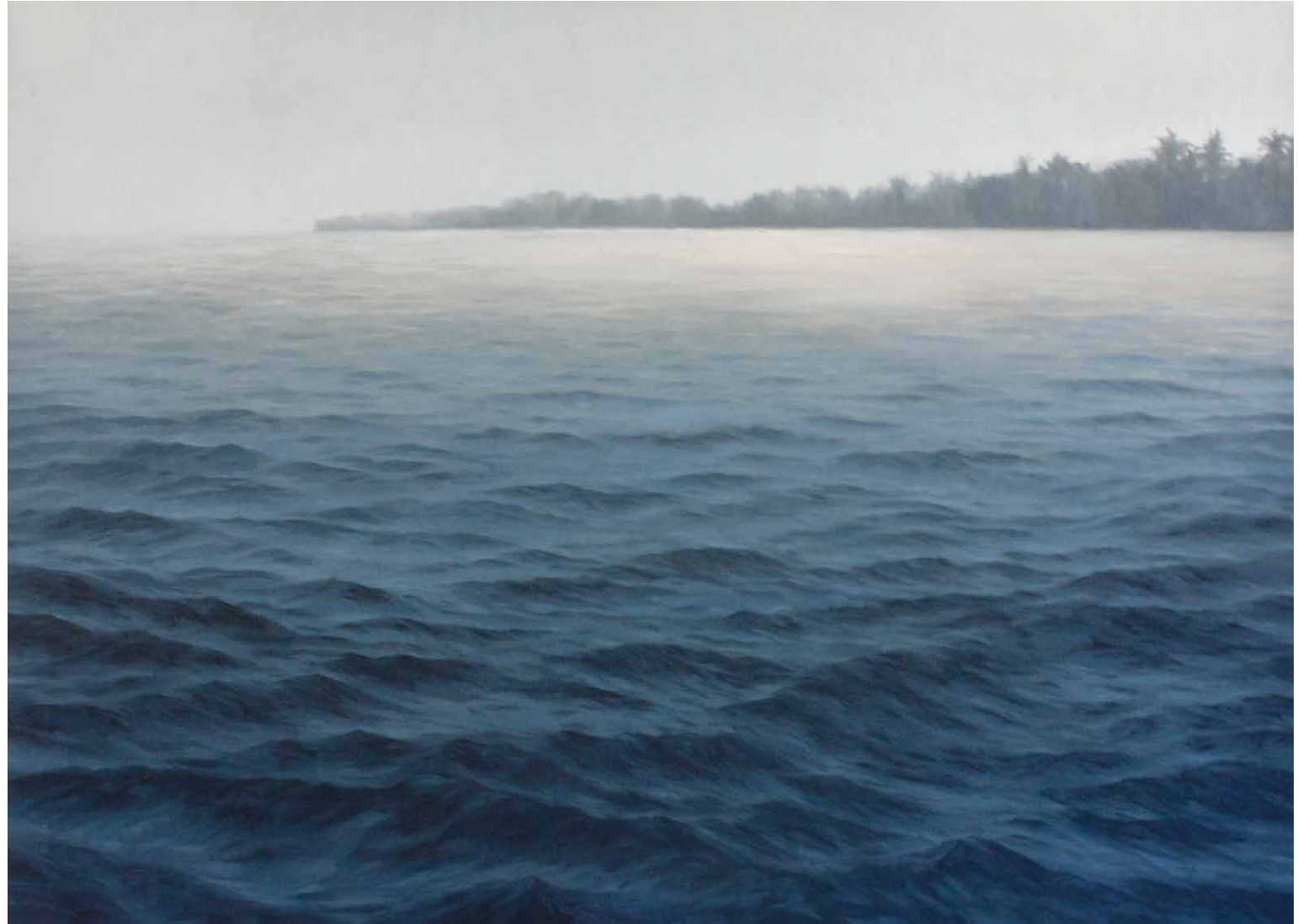
N10.871913, W85.902126 | 2013 | Oil on Canvas | 147 x 205 cm